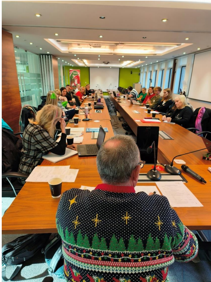
(CSP Welsh Board in full swing!)